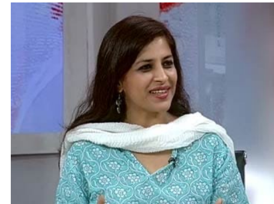
Shazia Ilmi Advisory Board LPP Spokesperson BJP